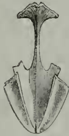
Palatal aspect of the truncated vomer of Ramphastos ariel , with the posterior parts of the palatine bones retained in union with it.

Ramphastos ariel , freed from its surroundings. It does not send forward limbs to join the maxillo-palatines [which are those of the desmognathous Capitonidæ inflated], but helps by its terminal expansion to complete, by contact or ankylosis with the palatine on either side, the posterior wall of a cavity in the dried skull, bounded laterally and superiorly by the inflated and infused maxillo-palatines, anteriorly by the nasal septum together with ossifications in the nasal cartilages associated with it.